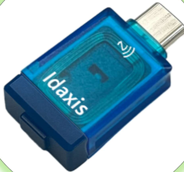
Idaxis® SecureWave™ USB-C